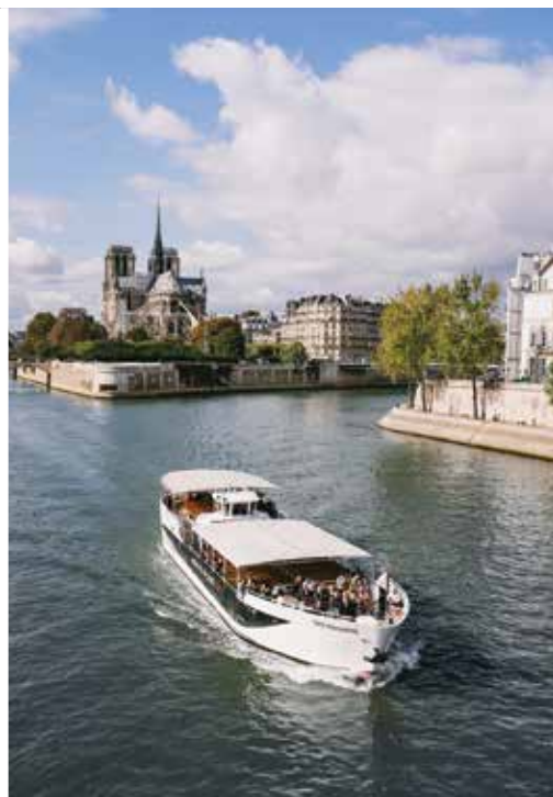
From left: The Pigalle by Night cocktail at Hôtel Barrière Le Fouquet's Le Marta, and cruising the Seine.