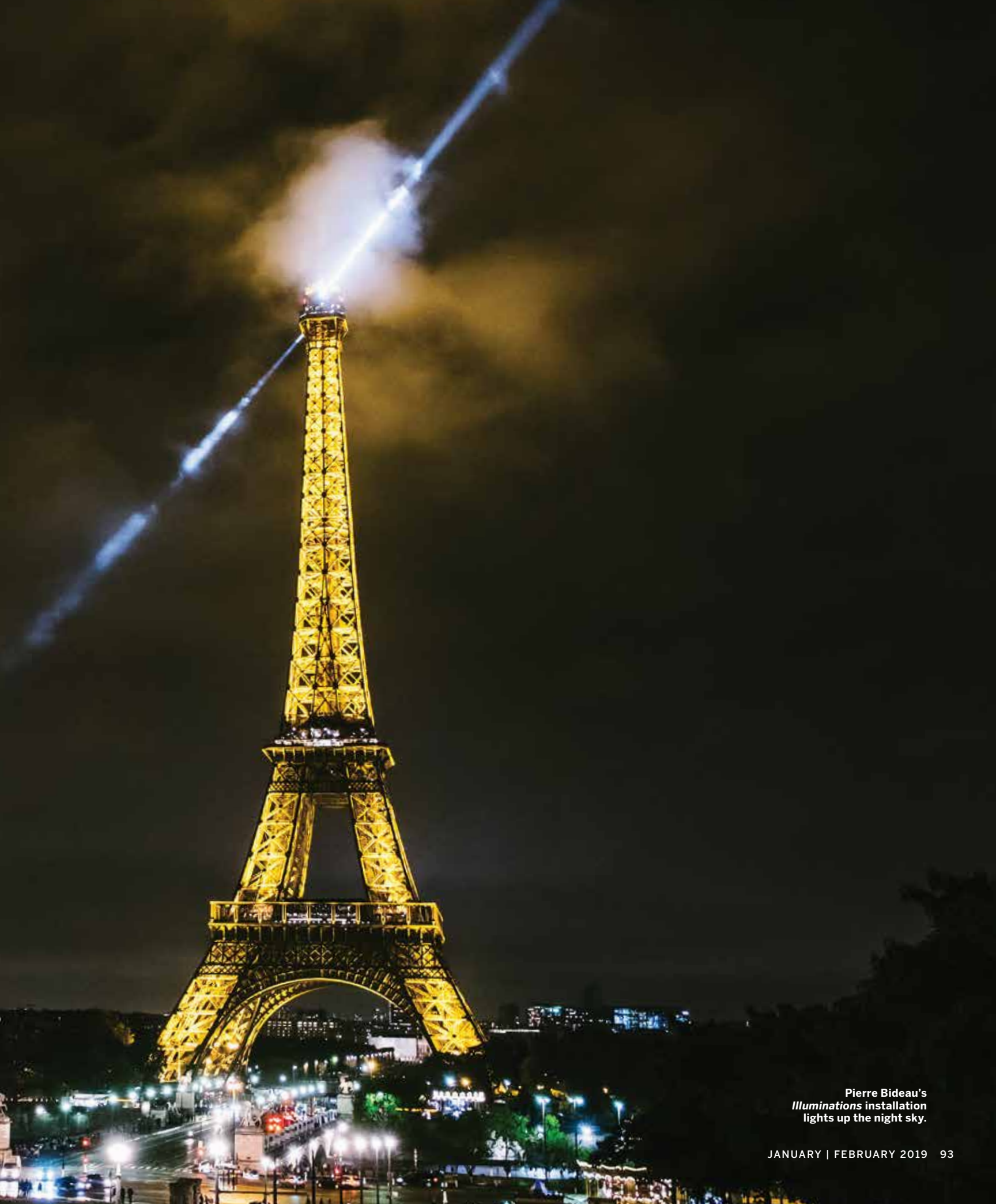
Pierre Bideau's Illuminations installation lights up the night sky.